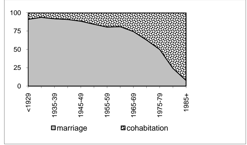
Figure 2. First partnerships by the type over the calendar period (year), per cent